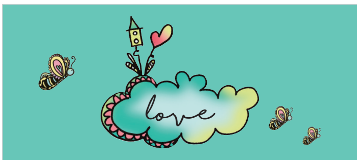
LEFT INSIDE POCKET